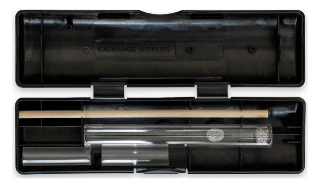
Fig. 2 SIPP Kit

service providers and will be delivered at study intervention sites for a period of six months.